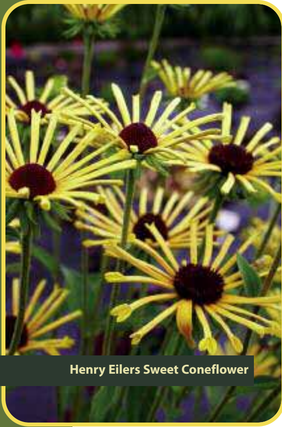
Henry Eilers Sweet Coneflower