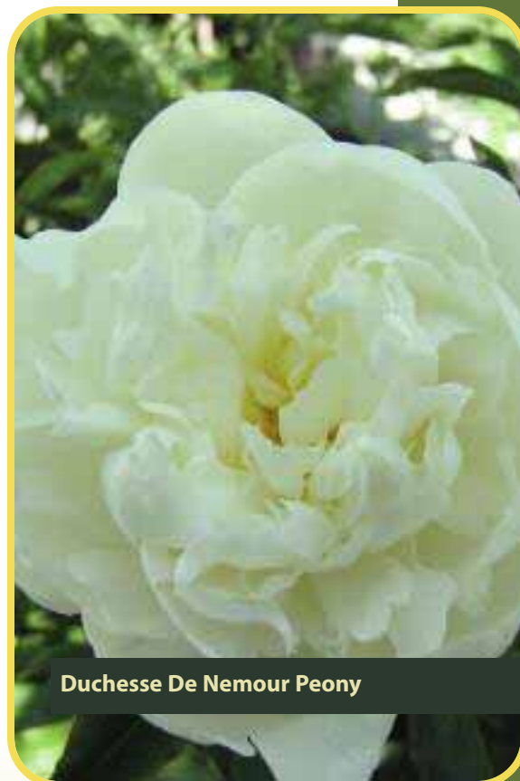
Duchesse De Nemour Peony