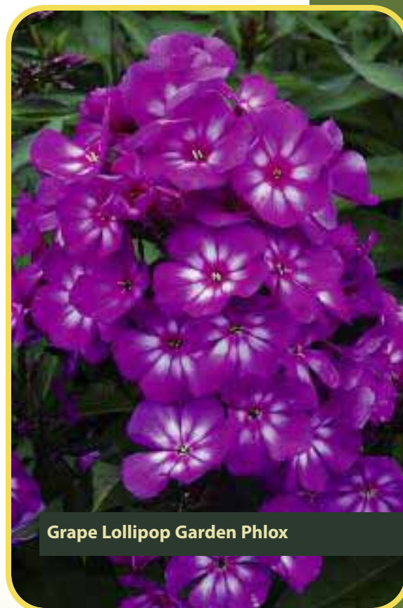
Grape Lollipop Garden Phlox