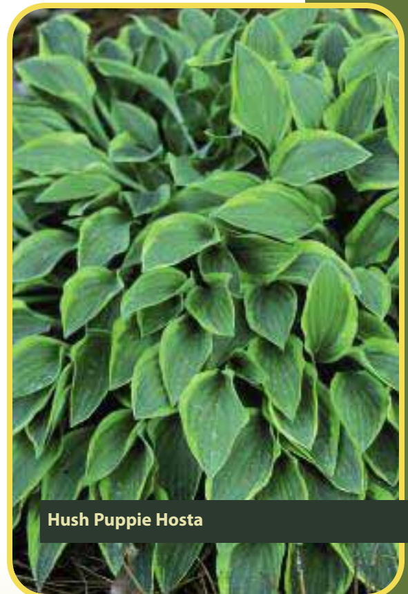
Hush Puppie Hosta