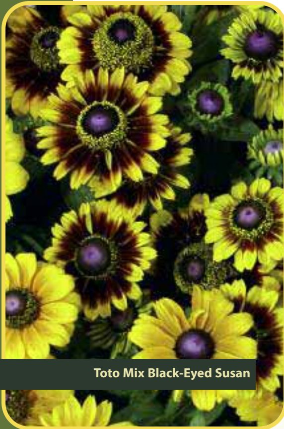
Toto Mix Black-Eyed Susan