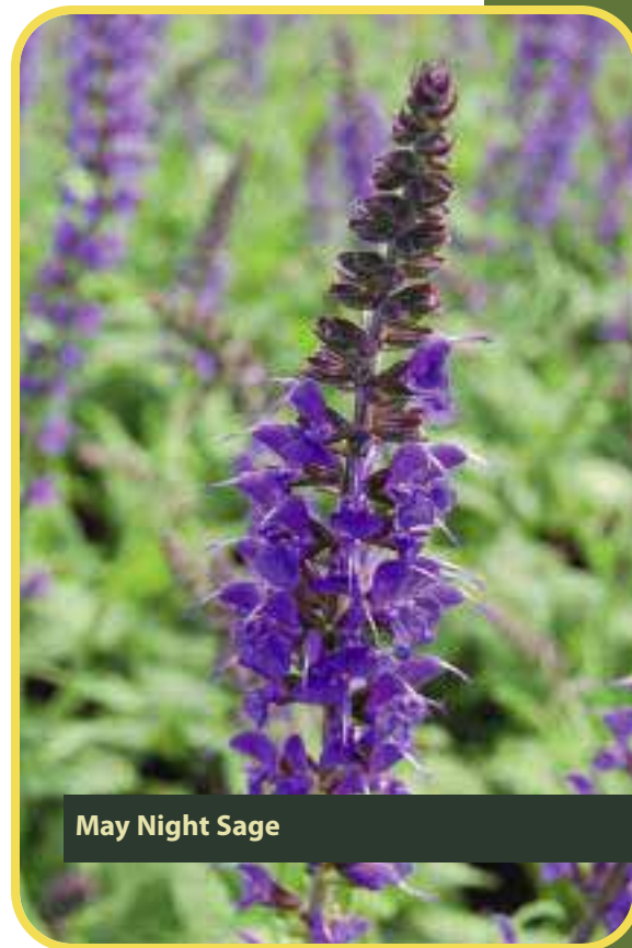
May Night Sage

Item # 812470 Mature Size: 24" tall x 18" wide Exposure: Sun Bloom Color: White flowers Bloom Time: Summer Hardiness Zone: 3 Heat Zone: 9