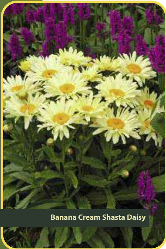
Banana Cream Shasta Daisy