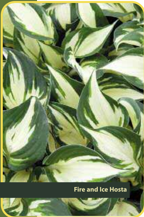
Fire and Ice Hosta