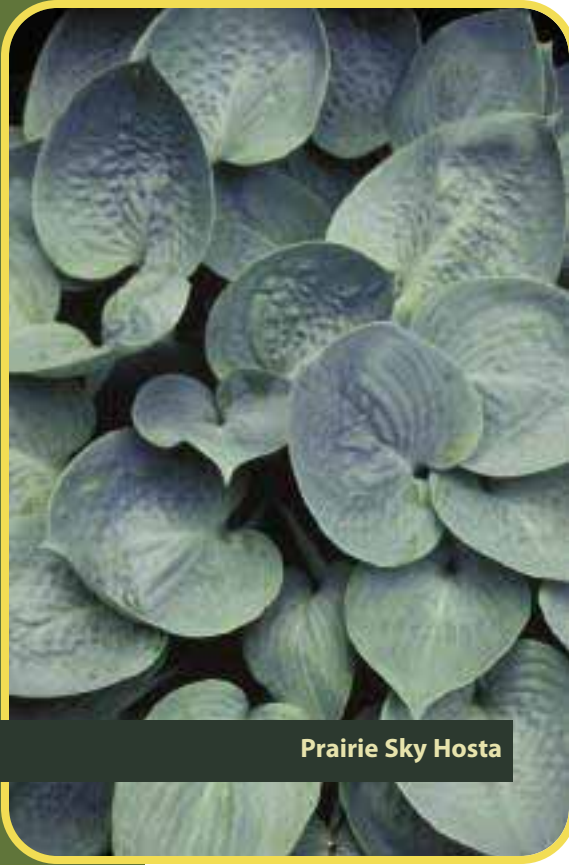
Prairie Sky Hosta