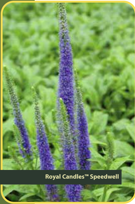
Royal Candles™ Speedwell