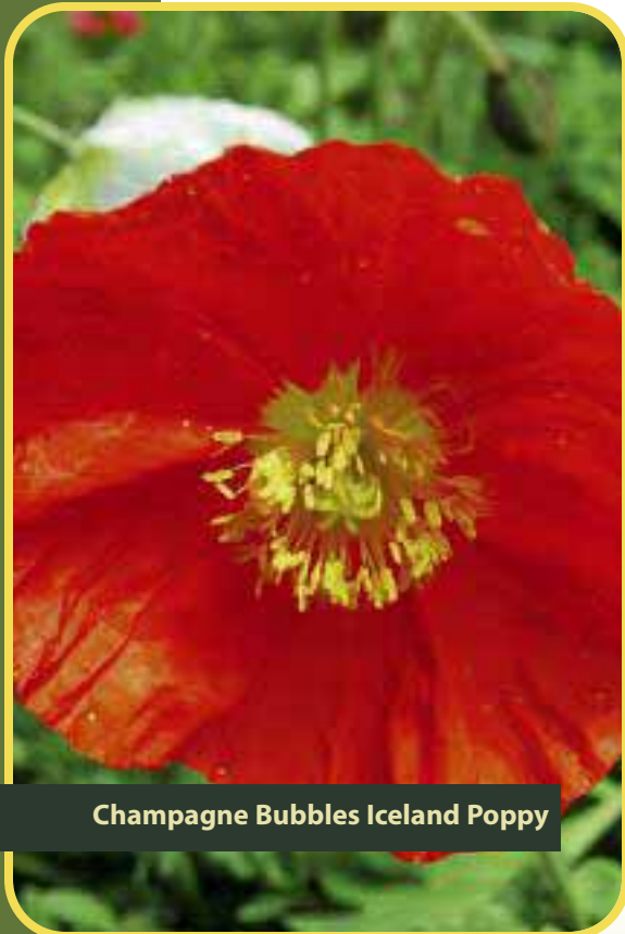
Champagne Bubbles Iceland Poppy