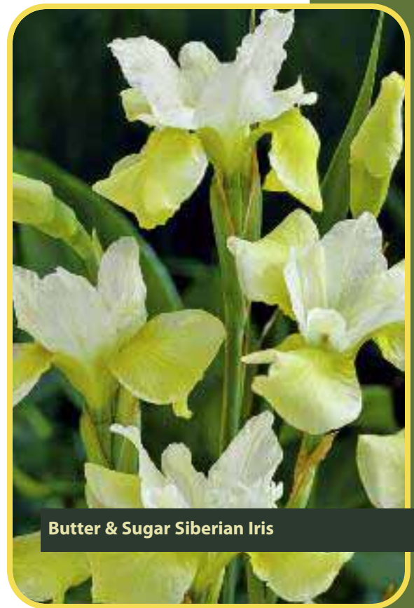
Butter & Sugar Siberian Iris