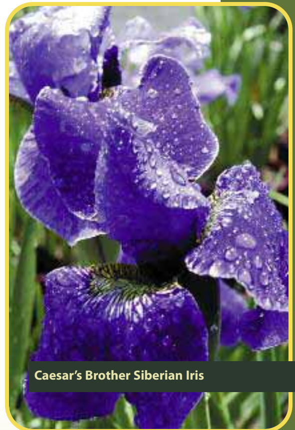
Caesar's Brother Siberian Iris