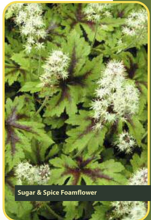
Sugar & Spice Foamflower