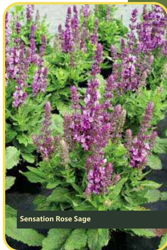
Sensation Rose Sage