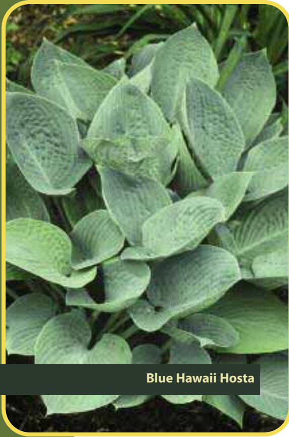
Blue Hawaii Hosta

Item # 441823 Mature Size: 16" tall x 36" wide Exposure: Shade Bloom Color: Lavender flowers Bloom Time: Mid-Summer Hardiness Zone: 3 Heat Zone: 8