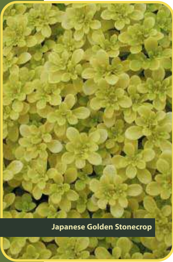
Japanese Golden Stonecrop