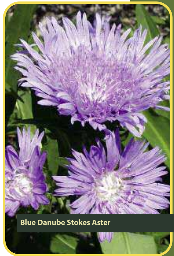
Blue Danube Stokes Aster