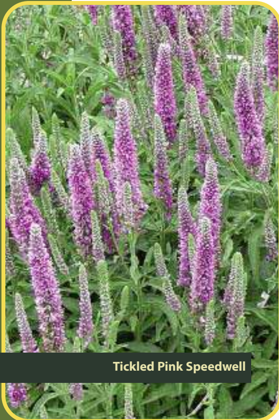
Ticked Pink Speedwell