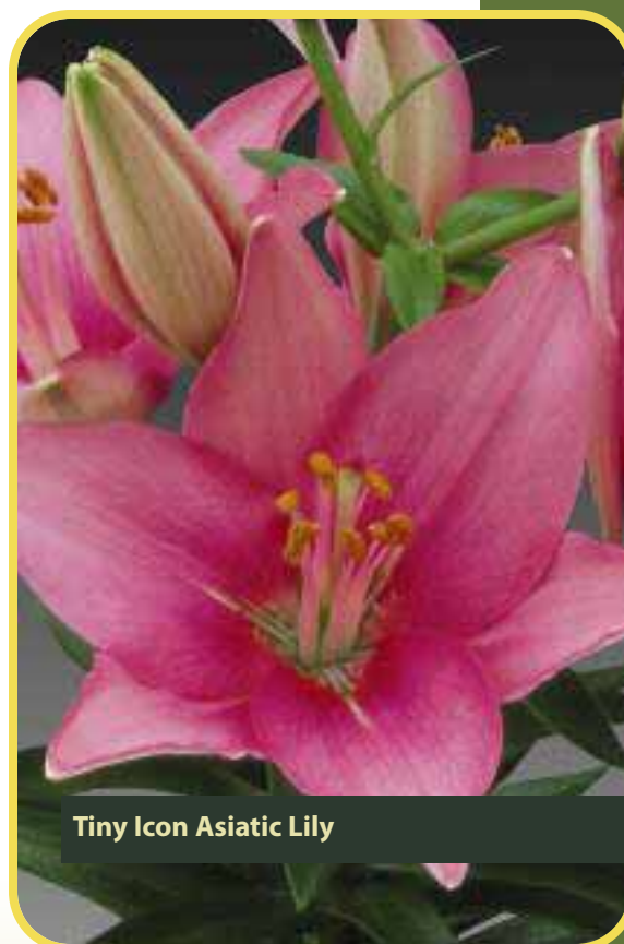
Tiny Icon Asiatic Lily