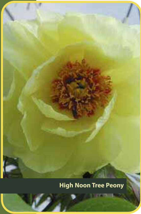
High Noon Tree Peony